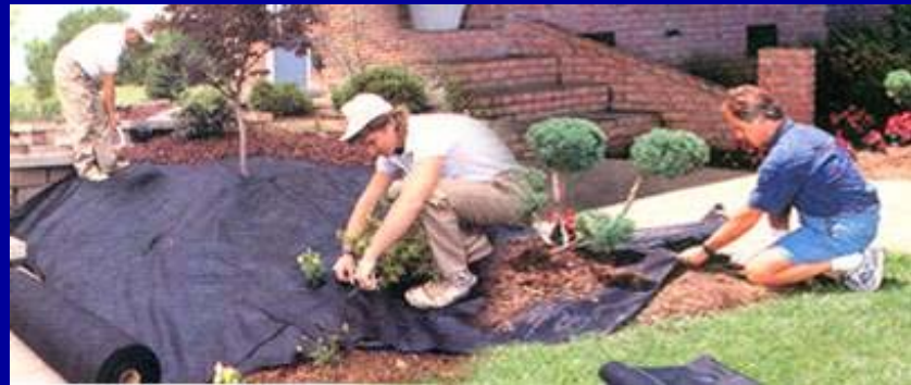
Weed Barrier Cloth