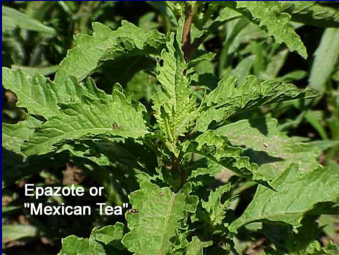
Epazote or "Mexican Tea"